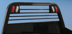
60" Tall Headache Rack