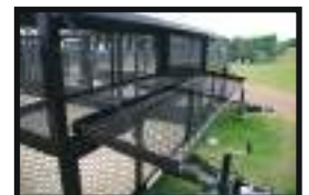
Removable /Lockable Landscape Box