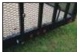
Gas Spring Assist on Ramp Gate