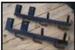
Removable Weed Eater Racks