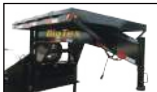
Deck on Neck