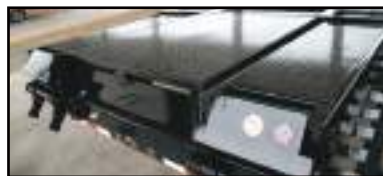
Center Pop-Up Dovetail