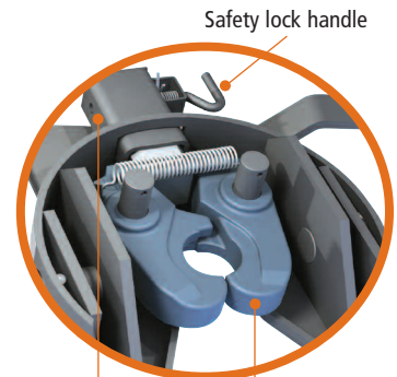
Safety lock handle Ductile iron locking block Ductile iron cast split locks