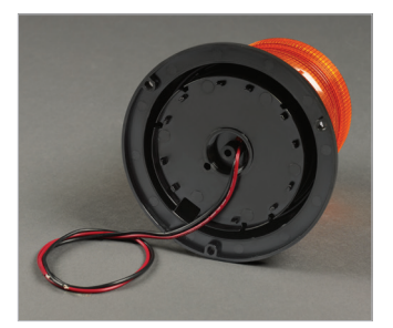
6.2" (15.7 cm)