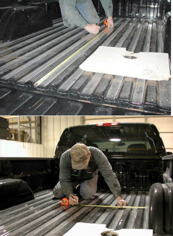
TIP: B&W uses a 3/4" piece of plywood as a drilling guide to prevent the hole saw from moving while drilling the 4" hole in the truck bed.